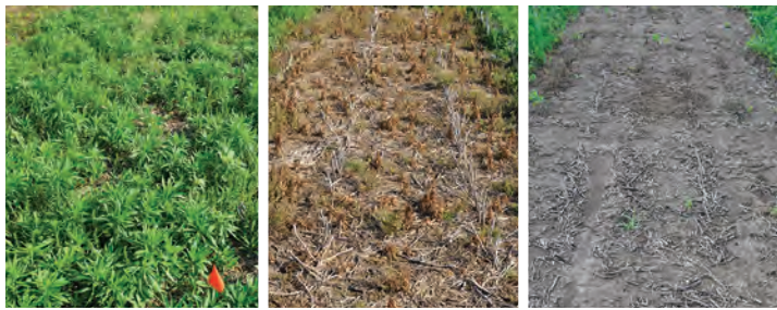
10 DAT Untreated Check